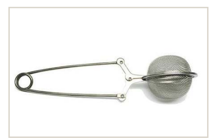
41516 Tea Ball Tong Stainless Steel Length - 4.5cm