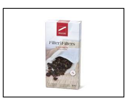
94501 Paper tea filter Size - S 100 per box