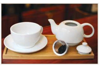
35136 Tea For One Set - Ceramic (cup, saucer pot with stainless steel strainer) Contains 0.25I