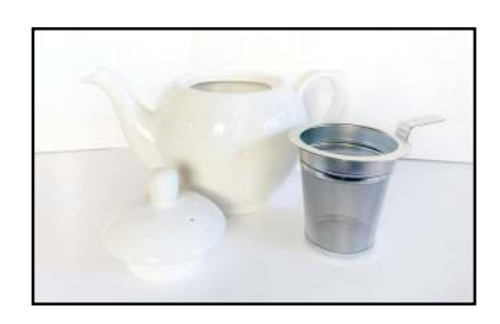
35135 Teapot With Stainless Steel Strainer - Porcelain Contains 0.35l